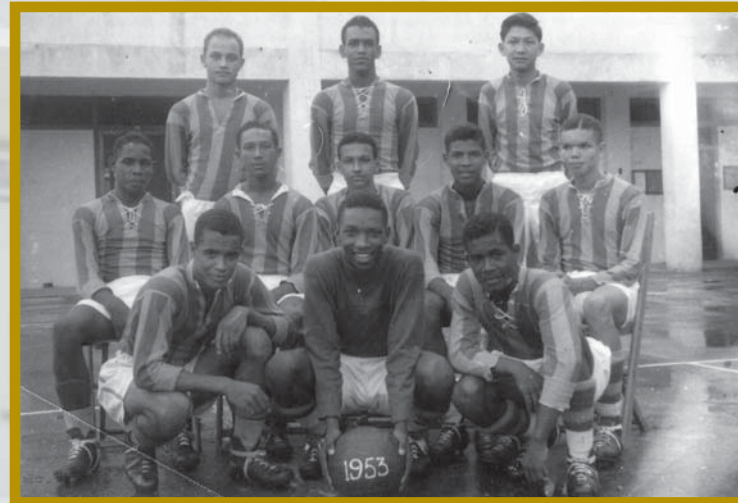
Football Team - 1953