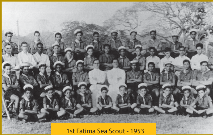
1st Fatima Sea Scout - 1953