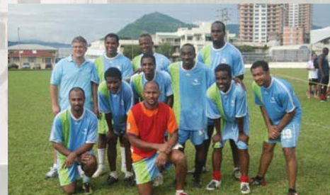
30-45 Group Winners - Sagikor Strykers