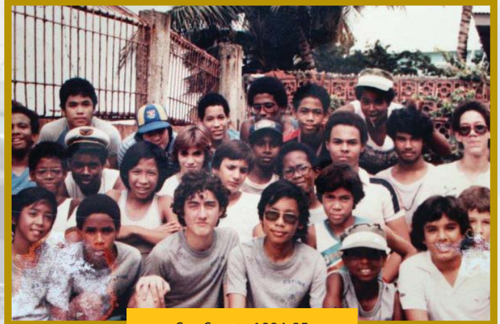
Sea Scouts 1984-85