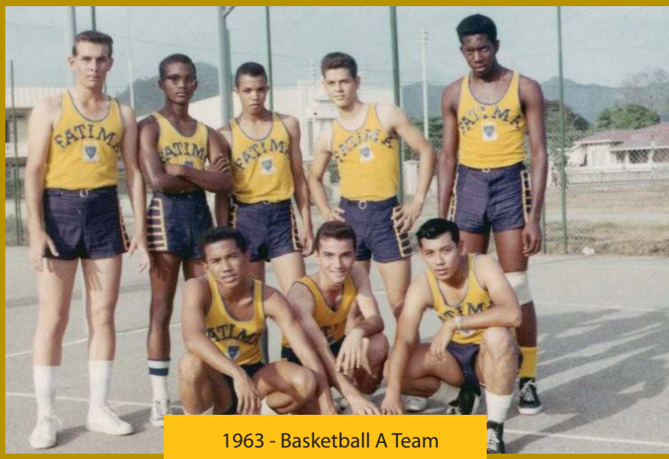
1963 - Basketball A Team