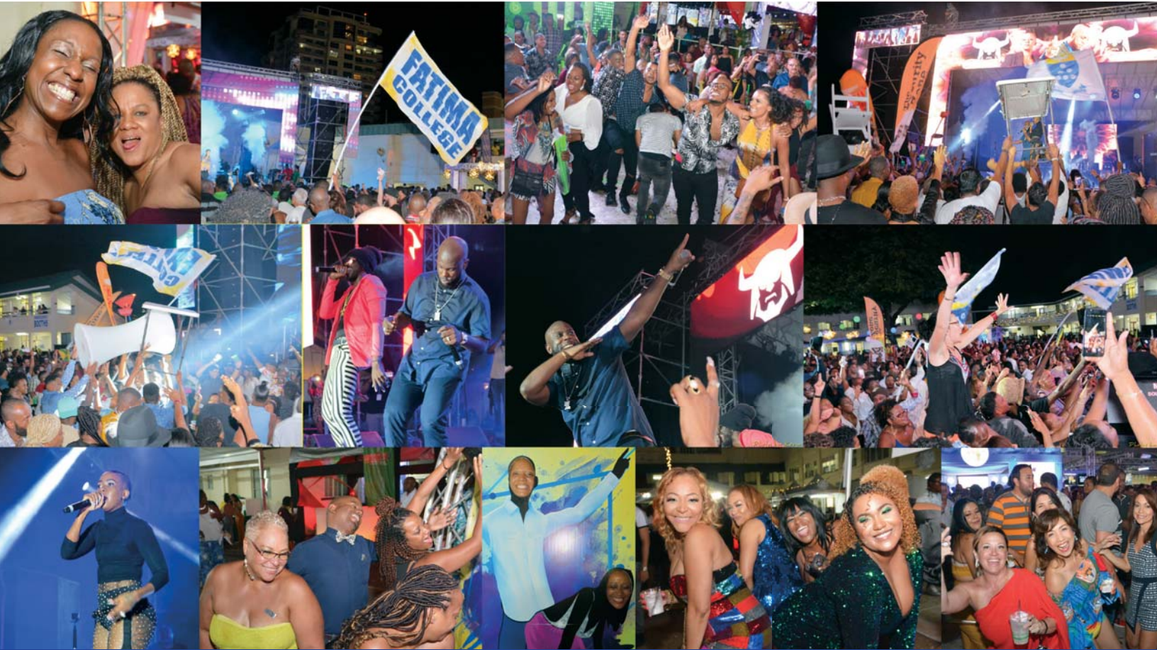
Visit the FOBA Facebook page or FOBA website for full albums