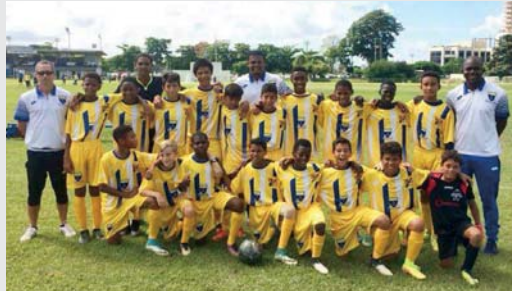
U13 League Champions