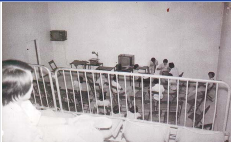
Audio Visual Room

If you have any old school photos that you would like to share, please submit them to: contact@foba.fatima.edu.tt