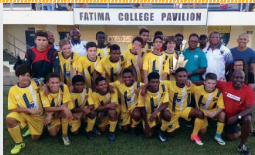
U16 National Champions