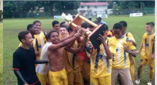
U14 National Champions