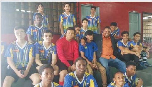
U20 National Indoor Hockey Champions