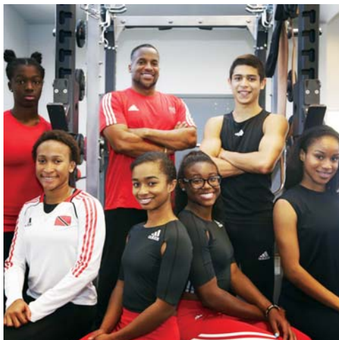
Ato with the Born 2 Do It Track Club

THE FATIMA CLASS OF 1986 CELEBRATED THEIR REUNION WITH A LIME ON FRIDAY 16TH DECEMBER 2016. THE WEEKEND OF EVENTS CULMINATED IN A LIME ON FATIMA GROUNDS ON SUNDAY.