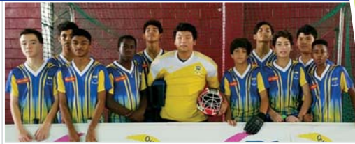
Sports - Hockey Under 20 Champions