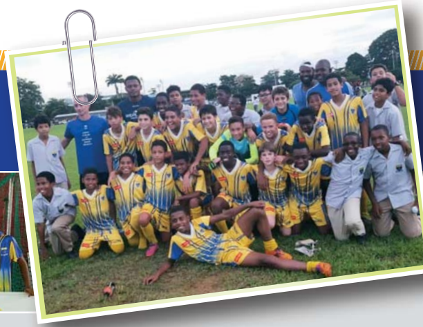
Sports - Football Under 13 League and Knockout Champions