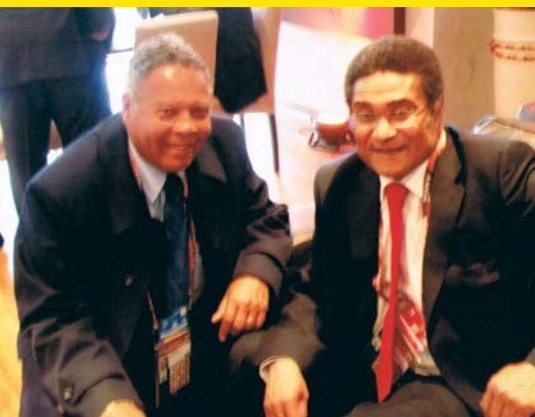
Alvin with Portuguese football legend Eusabio