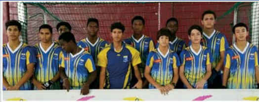
Sports - Hockey Under 15 Champions