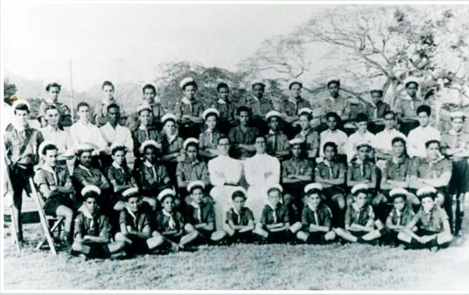
▲ 1953 1st Fatima Sea Scout,