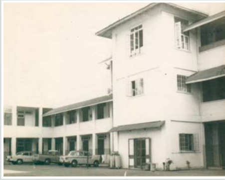
◀ 1984 - 1985 1st Fatima Seas Scouts