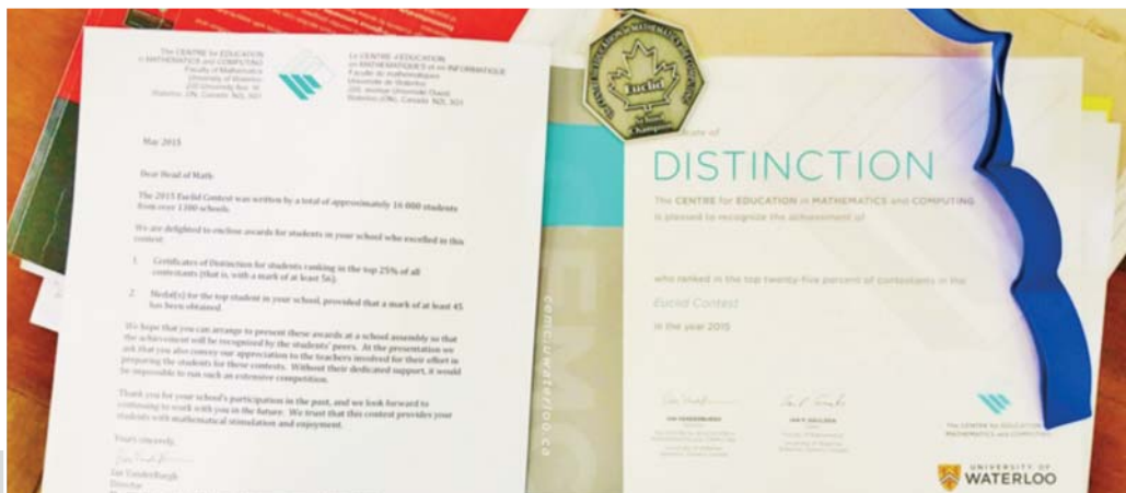
The medal and certificate awarded to Fatima College in 2015 for placing in the top 25% out of 16,000 international students who wrote the University of Waterloo's Euclid Mathematics contest. Fatima obtained a ranking of 111 out of 1300 schools.